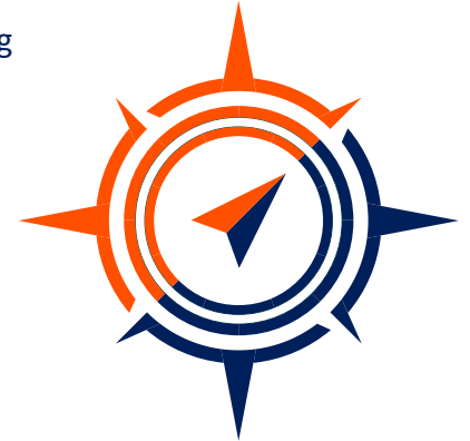
OVERALL EXIT PREPAREDNESS